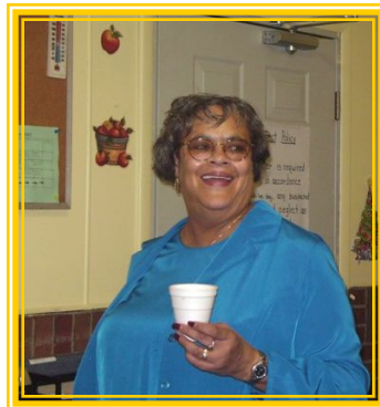
her "babies" at daycare!